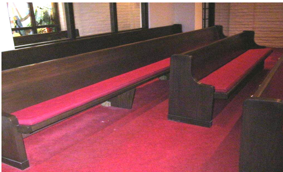
All Saints of the Desert, Sun City AZ

Here are three examples of pew cuts in Episcopal churches.