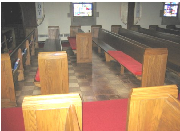
From national Episcopal Disability Network's Accessibility Guidelines for Episcopal Churches